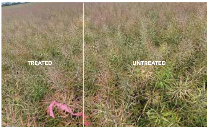
Res+ canola trial - treated and untreated