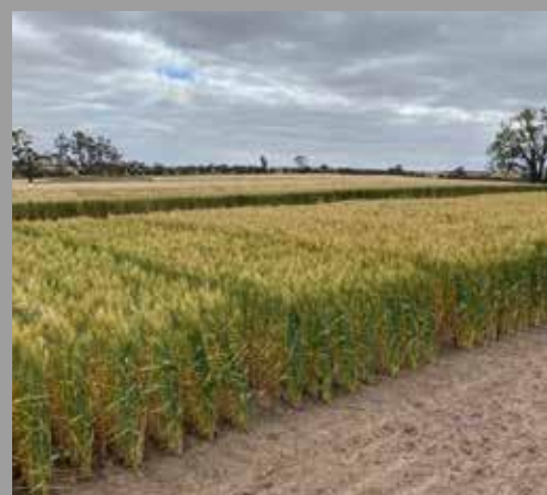
Site overview photo highlighting responses of various treatments.