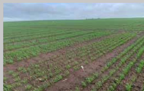
Site overview photo highlighting responses of various treatments.