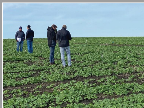
Lumen Canola Trial