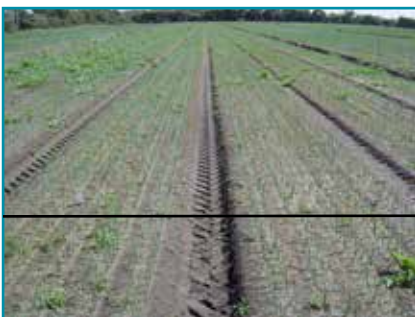
The trial site - above line