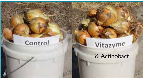
Actinobact & Vitazyme treatment increased yield by 7.5tonne per ha