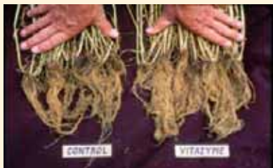
Vitazyme treated wheat produces exceptional root development