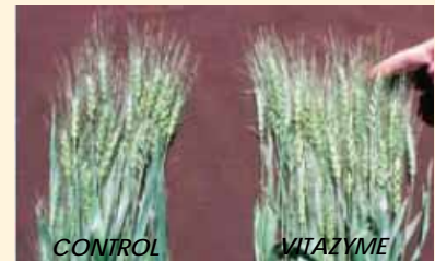
Vitazyme increases head number.