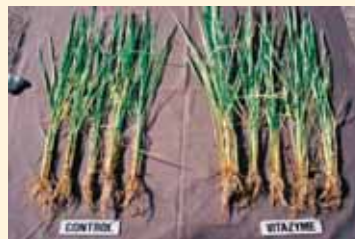
Vitazyme treated wheat shows excellent stalk strength, heading, leaf development and disease resistance.