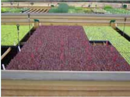
The trial site - lettuce