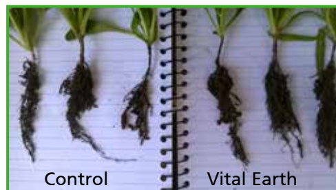
Improved root growth with Vital Earth